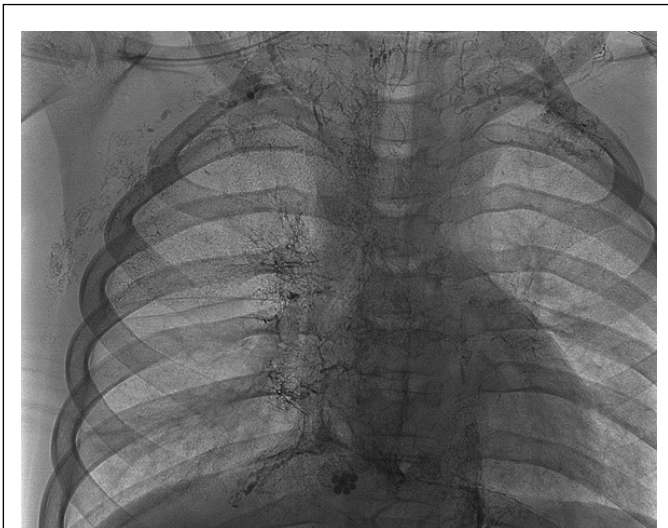
Figure 1) Chest radiograph demonstrating Lipiodol® in peribronchial lymphatic ducts.

Approximately one hour after admission on the PACU, the patient became acutely unresponsive and had a generalized tonic-clonic seizure. The seizure lasted only 30 seconds and faded spontaneously before any benzodiazepines were given. A head computed tomography (CT) scan showed countless hyper densities throughout the brain (Figure 2). When readmitted to the PACU, a new seizure occurred, lasting longer than the first one. Because the patient was desaturating as well, the trachea was intubated with 80 mg of propofol and 30 mg of rocuronium. An arterial and central venous line were placed due to hemodynamic instability and noradrenaline was infused. Levetiracetam was given intravenously and the patient was transferred to the pediatric intensive care unit.