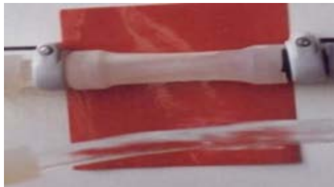
Figure 3: The Chamber C around the G tube is made of soft rubber which is sucked in by the negative pressure gradient of the G Tube. The interstitial pressure fluid has negative pressure of -7 ml water.

C moves in magnetic field-like fluid circulation (5) taking an opposite direction to lumen flow of G. tube. The inflow (arterial) pressure 1 and orifice 2 induce the negative side pressure energy creating the dynamic G-C circulation phenomenon that is rapid, autonomous and efficient in moving fluid out from the G tube lumen at 4, irrigating C at 5, then sucking it back again at 3, maintaining net negative energy pressure (7) inside C. The distal out flow (venous) pressure (6) enhances out flow at (4) and its elevation may turn the negative energy pressure 7 inside C into positive, increasing volume and pressure inside C chamber